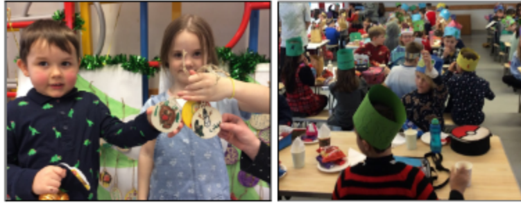
Some of the winners of the Christmas bauble competition. Enjoying our party food.