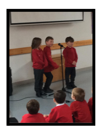
Giraffes- the winners