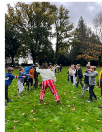
A morning filled with movement, poetry and some battles, all in nature's classroom!