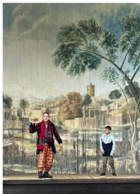
Welcome from the Madhatter!

Snow Leopards enjoyed exploring the Larmer Tree Gardens this week. They took part in a range of creative activities.